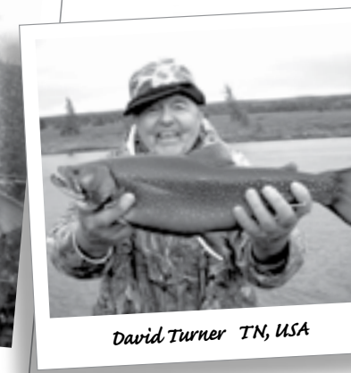
David Turner TN, USA

On September 9th 2006, Arctic Adventures' angling guest Jeff Turner from Dallas, Texas live released the biggest brook trout ever caught at the Tunulik II Fishing Camp on the LaGrève River in Nunavik, Quebec.