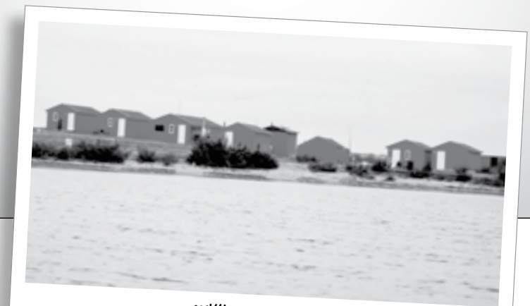
Willie's Caribou Camp

Along with the best accommodations, our dedicated cooks continue to serve copious quantities of great food which our guests appreciate. Our guides and camp managers have been with us for many years and they know what to do to please their guests and when to do it!